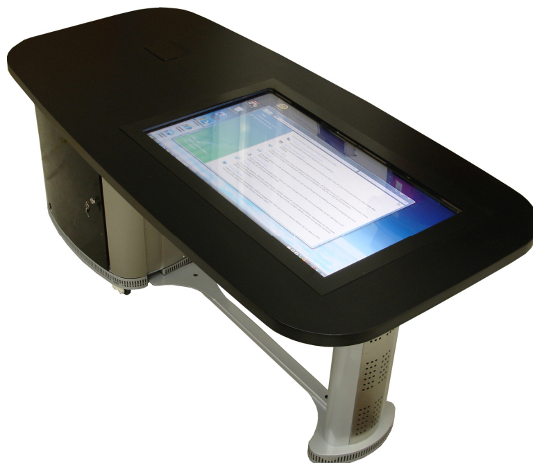
TeamMate TouchTable showing 40" display