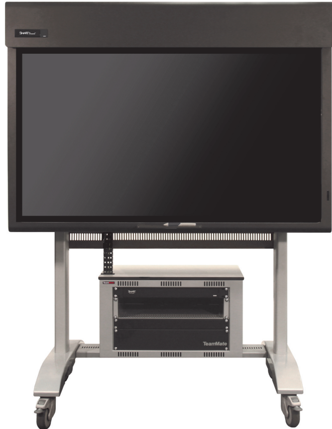
SMART Board 6052i Interactive Display purchased separately

When used with the SMART Board 6052i Interactive Display, this aesthetically designed, high quality mobile stand provides a self contained presentation and learning resource.