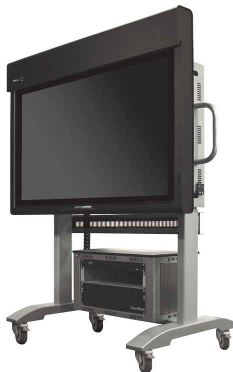
SMART Board 6052i Interactive Display purchased separately